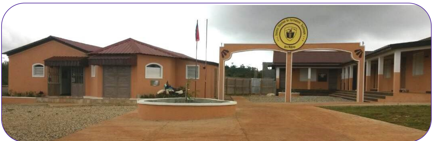
Christian Institute for Technical Training building

The C-Tech program has the potential to make a huge difference in Haiti by equipping young people with skills to provide for themselves and their families.